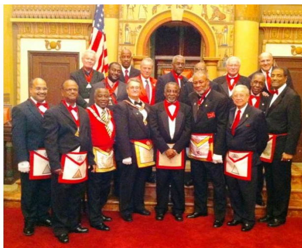
Pictured above are some of the Companions from the 1 st Capitular District in attendance that night.

I am glad that I can now say that I have had this chance to meet with the 1 st Capitular District and have added the memory of that night to those cherished memories that I will carry through all the days of my life! ♦